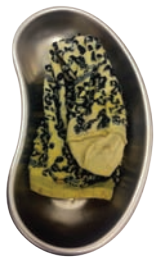
A very expensive sock that was removed from the intestines of a dog

So – as well as trying to ensure your pets don’t eat these objects, we strongly recommend pet insurance to cover you against these unexpected eventualities!